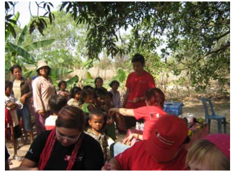
On the way to Medical clinics