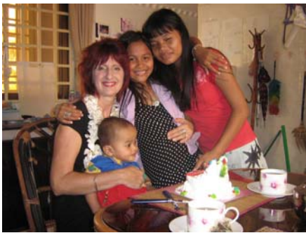
Sharing Traces Birthday