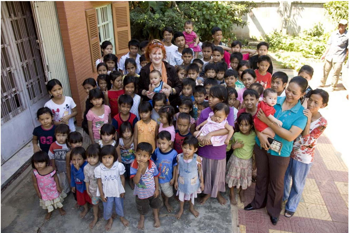
LIA Family Phnom Pehn