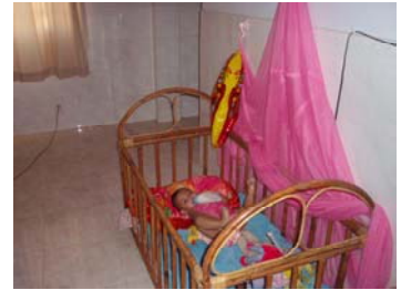
Volunteers fund raised and purchased new furniture and accessories for a third home where Ruth is based and set up a nursery for our babies