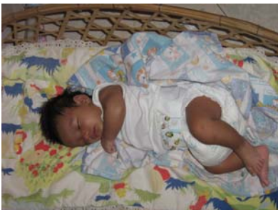
Baby Moses with us for 5 days