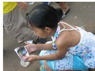
Little girl reads a handout about Jesus. That was exciting to see here in Cambodia