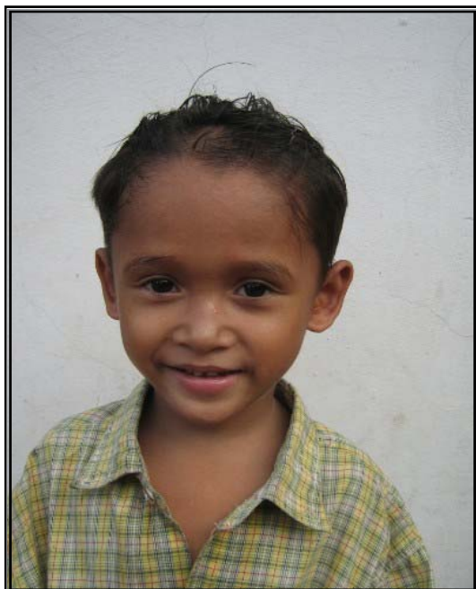
In need of Love