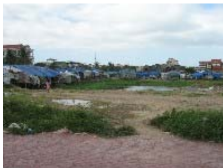
Slum Area in the city