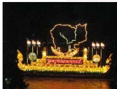
Part of night display

It has been water festival time where Cambodia celebrates the changing of direction of the Mekong river for six months of the year due to melting snow in the himalyas here are a few pics.