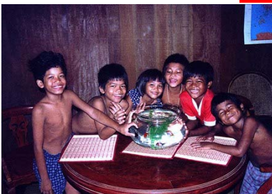
Our first six children 2004