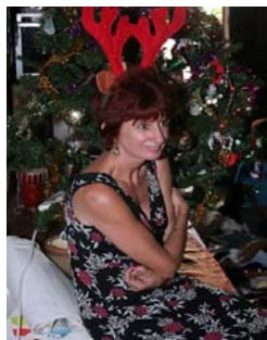
Trace, Santa's little helper