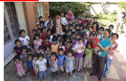
Look at us now! and counting !