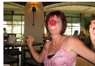
From reindeer to red nose and pink lips. Not much changes over the years!!!!