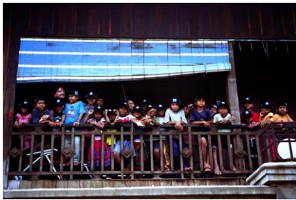
Our first home

Some stories are posted on our website. At LIA we have a team house that provides a safe and homely place for teams to stay while they are on their Cambodian experience. We are very grateful to all of you that have come and assisted us over these last five years and we look forward to those that are still to come. Some people have come to us by being referred by a fellow traveller and come in to see and be part of what we do. They have a great experience that they didn't expect. We love to see you and thank you all for coming. We welcome you !