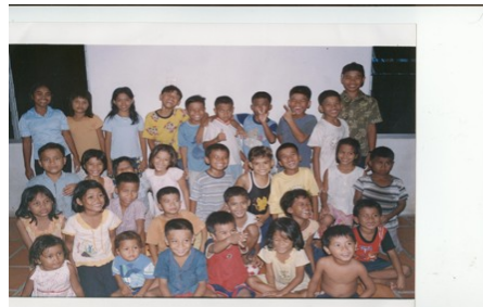
Our first collection

God is a busy worker but loves to be helped.