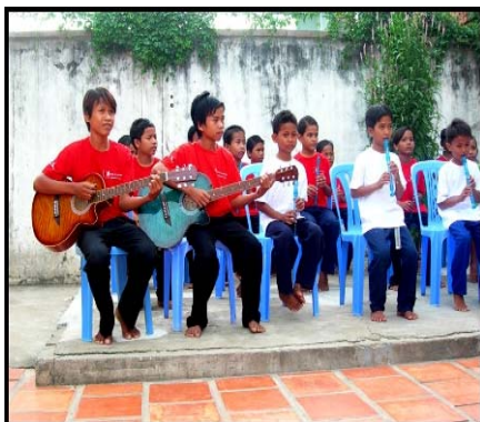
Music is what feelings sound like. These are our musicians.