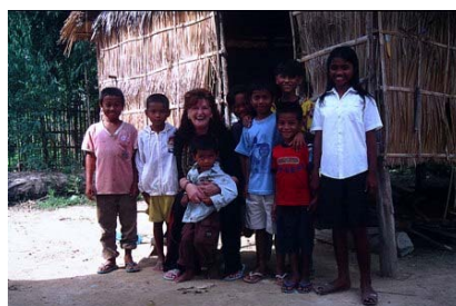
Eight more are added to our